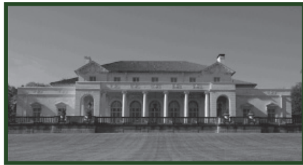
Historic Col. Oliver Hazard Payne Mansion