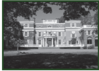
Home of Franklin D. Roosevelt