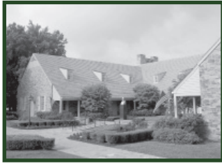
FDR Presidential Library