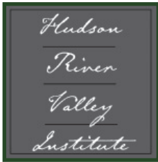
Hudson River Valley Institute