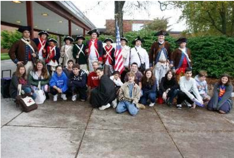
(below) Students, teachers and guests stand next to a plaque marking the trail of British Major John Andre during his ride towards New York at the Mildred E. Strang Middle School in Yorktown Oct. 5, 2010.