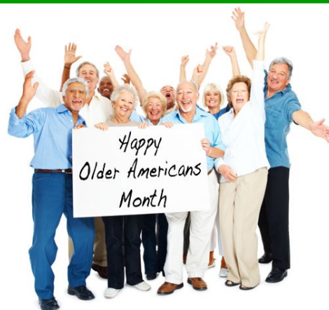
Older American Month

While not one of the most well-known celebrations in the United States, May is Older Americans Month. During this month, senior citizens are shown appreciation through several inexpensive or free events often organized by non-profit organizations. Many of these organizations can be found in the Hudson River Valley. One is the Elant at Goshen Nursing Care Center, located in Orange County. On Tuesday May 15 th at 2 p.m., the center is offering a Bluegrass musical that is being