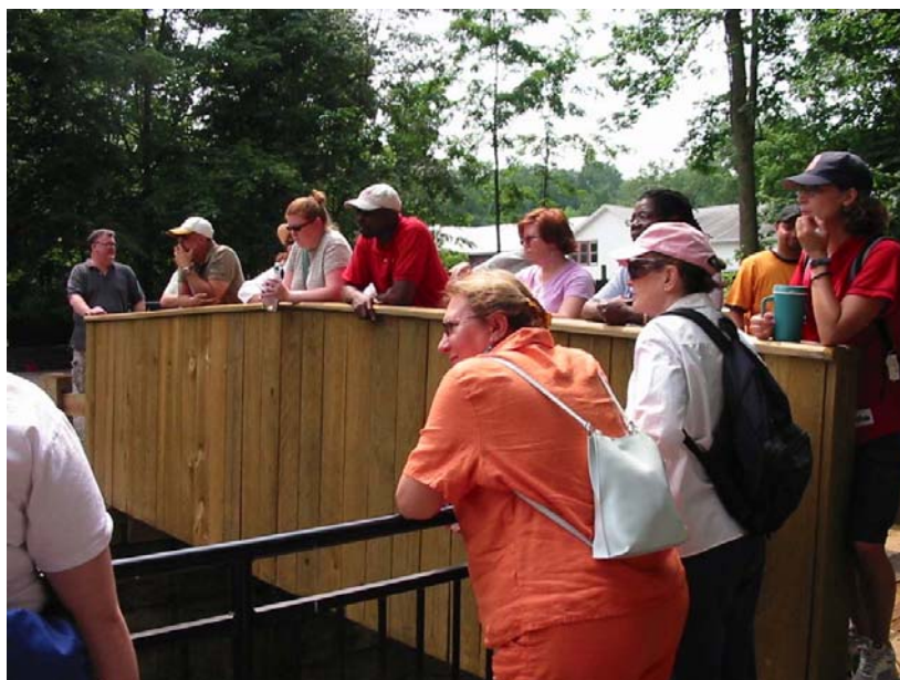
A tour of the D&H Canal Locks.