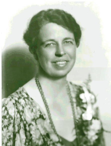
Eleanor Roosevelt during the 1930’s