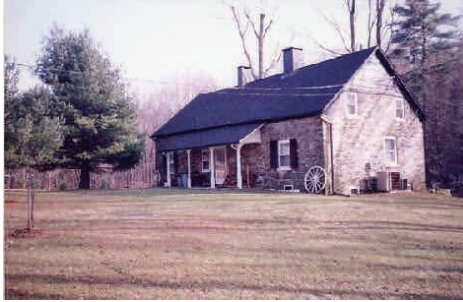
Farmhouse where Truth escaped to during 1826, one year before New York repealed all slavery in the state.

out against the evil institution. She made several moving