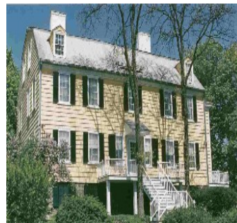
Historic Cherry Hill