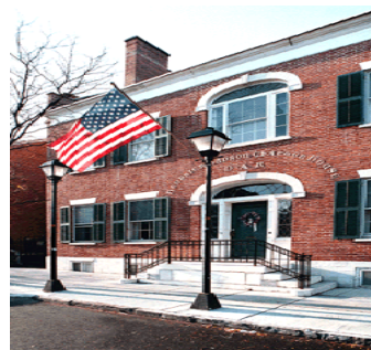
DAR Chapter House