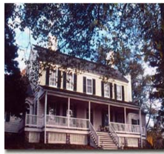
John Jay Homestead