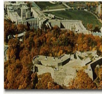
WestPoint from Fort Putnam