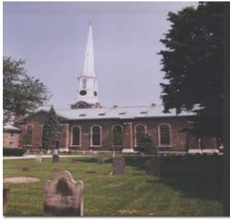
Protestant Dutch Church

Historical Description: Although the present Reformed Protestant Dutch Church (Old Dutch) was constructed in 1852, the congregation was organized in 1659. October 16, 1777, the British burned the edifice that had been built in 1679 and enlarged in 1752, along with the rest of the village. Among the notable persons interred in the present churchyard is George Clinton, brigadier general in the Revolutionary War, first governor of New York State, and vice-president under Thomas Jefferson and James Madison. He is surrounded by some seventy Revolutionary War soldiers, many of whom were Clinton's officers. George Washington visited the church in November 16, 1782.