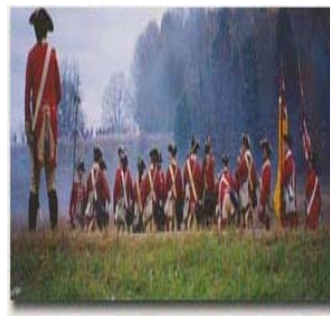
Battle of White Plains Reenactment