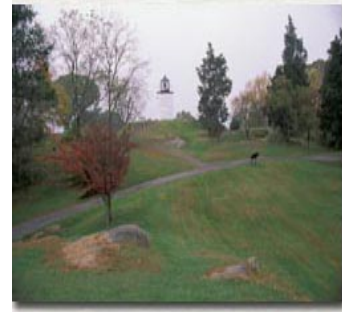
Stony Point Battlefield, (Bleeker)