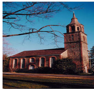
Saint Paul's Church