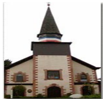
First Dutch Reformed Church, (Felicia Ritters)

Hours: Church has no posted hours Graveyard M-F until dusk Sunday afternoons