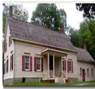
Van Wyck House