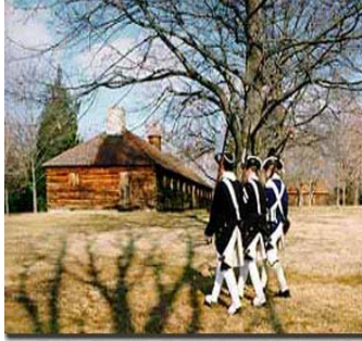
New Windsor Cantonment

Historical Description: The New Windsor Cantonment was the final encampment of Washington's army during the Revolutionary War and at that time was a thriving community of 8,000 soldiers as well as their families and skilled artisans. The army arrived here in October 1782 and left in June 1783. By late December 1782 the soldiers had constructed some 600 log huts. Officers of the Continental Army challenged Washington and Congress in the so-called Newburgh Addresses, but these challenges were defused with General Washington's famous speech at a meeting held in the Cantonment's Temple of Virtue on March 15, 1783. The "Proclamation of the Cessation of Hostilities," effective on April 19, 1783, which was the cease-fire that ended the American Revolution, disbanded the army and sent its soldiers home shortly thereafter.