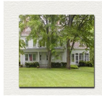
John Kane House