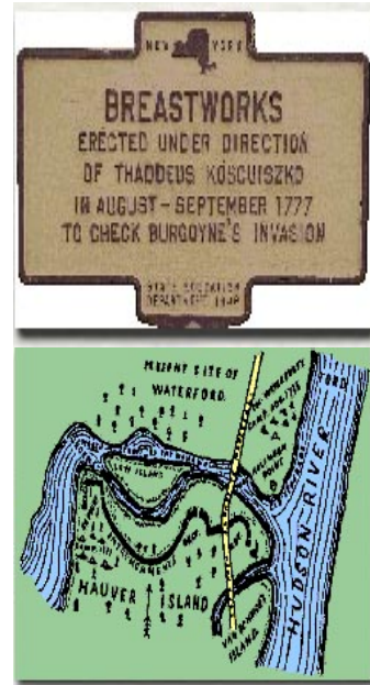
Haver (Peebles) Island Marker Map