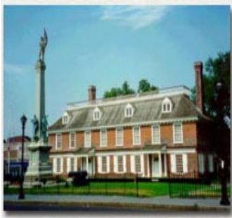
Philipse Manor Hall

Historical Description: Philipse Manor Hall was built in the 1680s by Frederick Philipse as a dwelling on the Lower Mills portion of his 52,500-acre estate. Philipse Manor Hall was an important symbol of what happened to Loyalists during the Revolution. Frederick Philipse III was LORD of Philipse Manor Hall during the Revolutionary period. His strong Loyalist views prompted him to sign the Declaration of Dependence in 1776, which caused George Washington to order his arrest. He lost the manor hall and the land it was on when the New York State Legislature confiscated it and eventually fled to England where he died broken in spirit and heart.