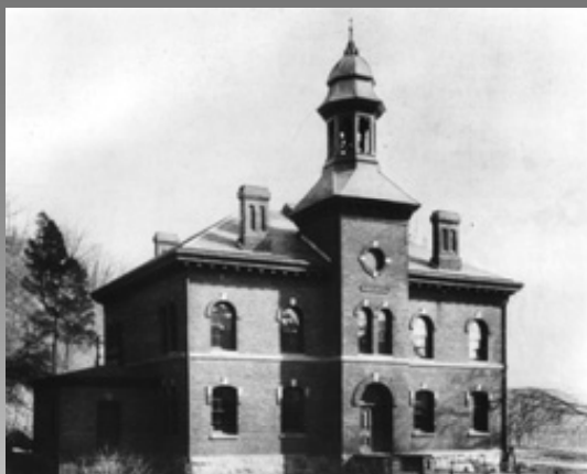
West Point Foundry