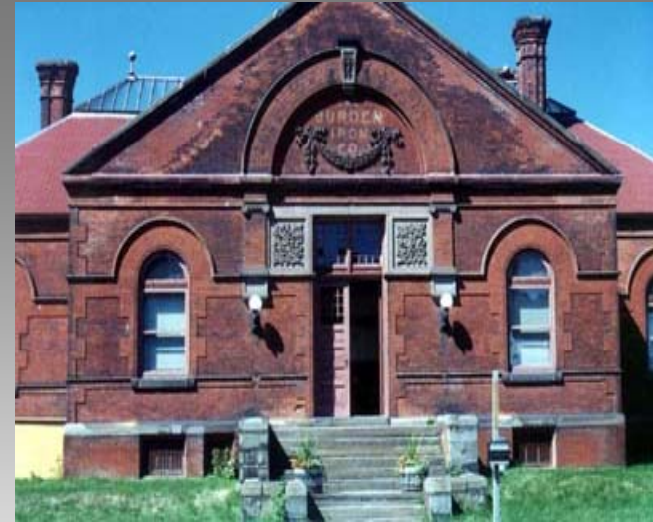
Burden Iron Works Museum

Hours: Guided tours by appointment only.