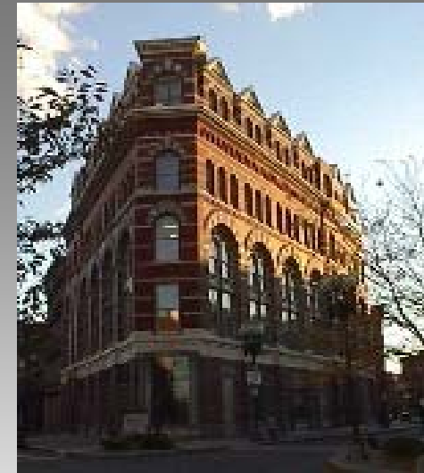
River Spark Visitor Center