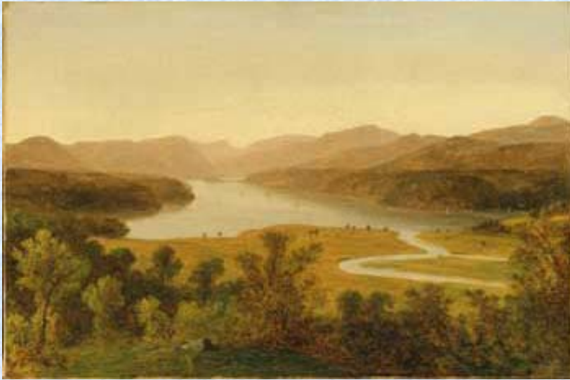
Highland Hudson River-(Undated)