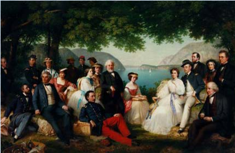
A Pic-Nic on the Hudson-1863