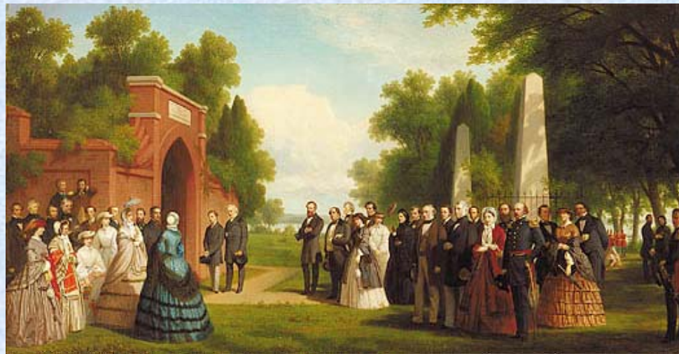
Visit of the Prince of Wales, President Buchanan, and Dignitaries to the Tomb of Washington at Mount Vernon, October 1860

http://www.askart.com/theartist.asp?id=20484