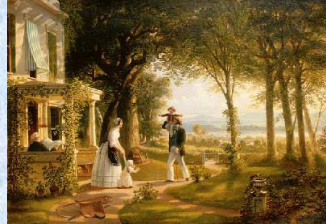
House On The Hudson- (1852)