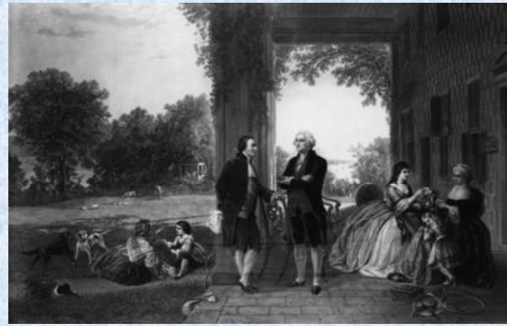
Washington and Lafayette at Mount Vernon