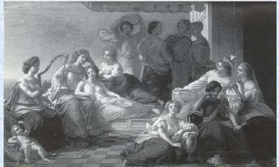
Muses and Graces-1859 Oil

http://www.usartists.org/gallery.php?artist=284