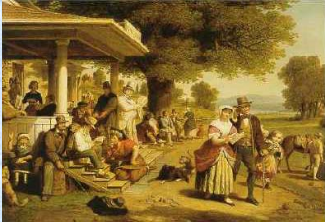
The Rural Post Office (Undated)