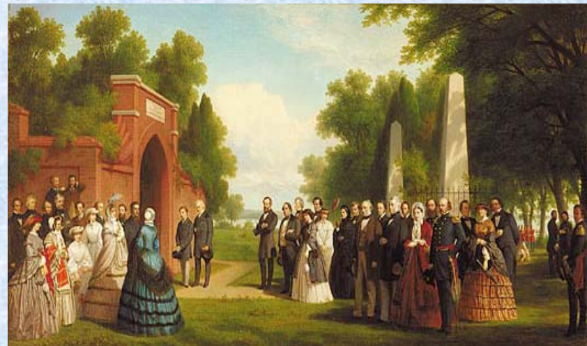
Tomb of Washington at Mount Vernon