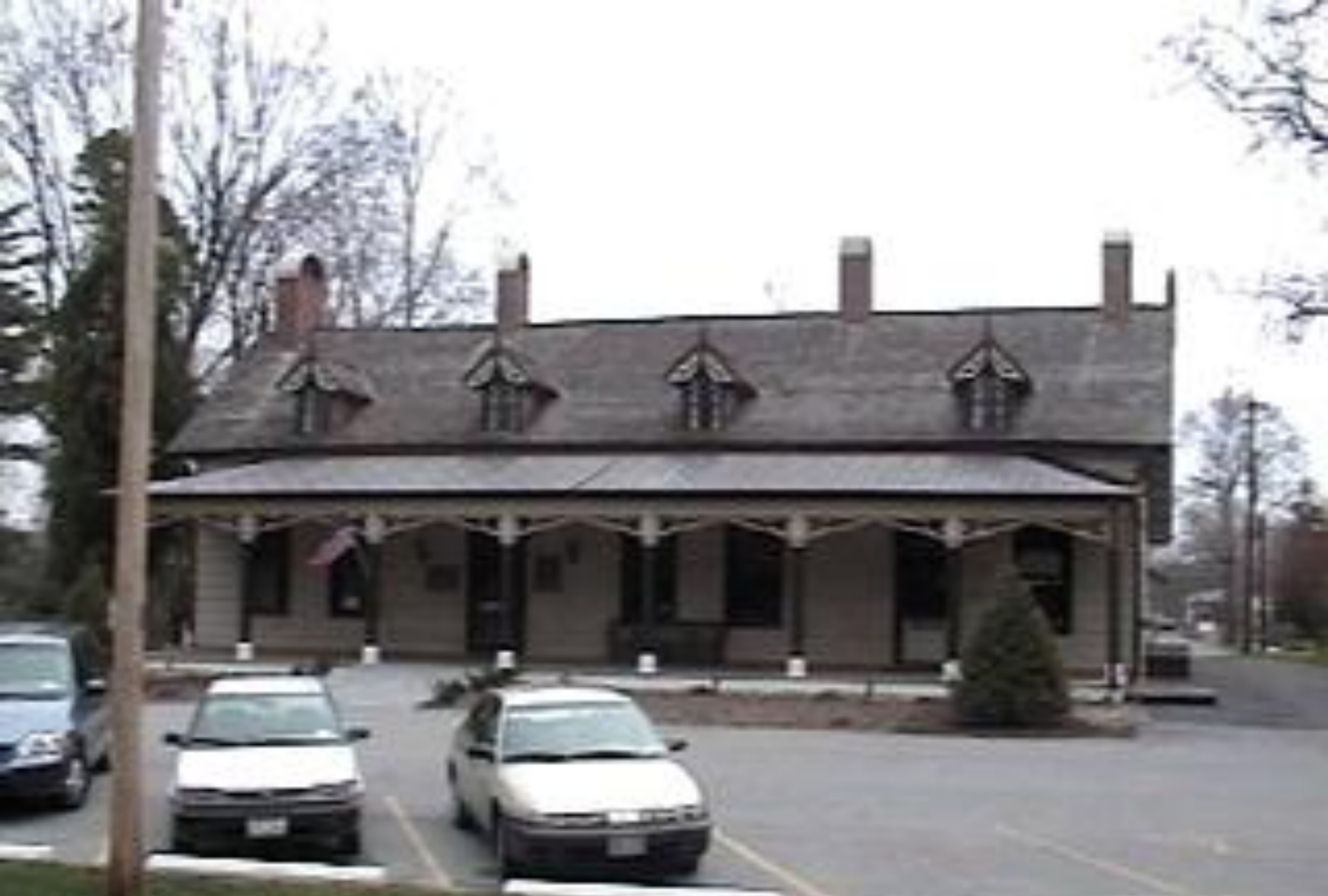
Brewer Mesier Home