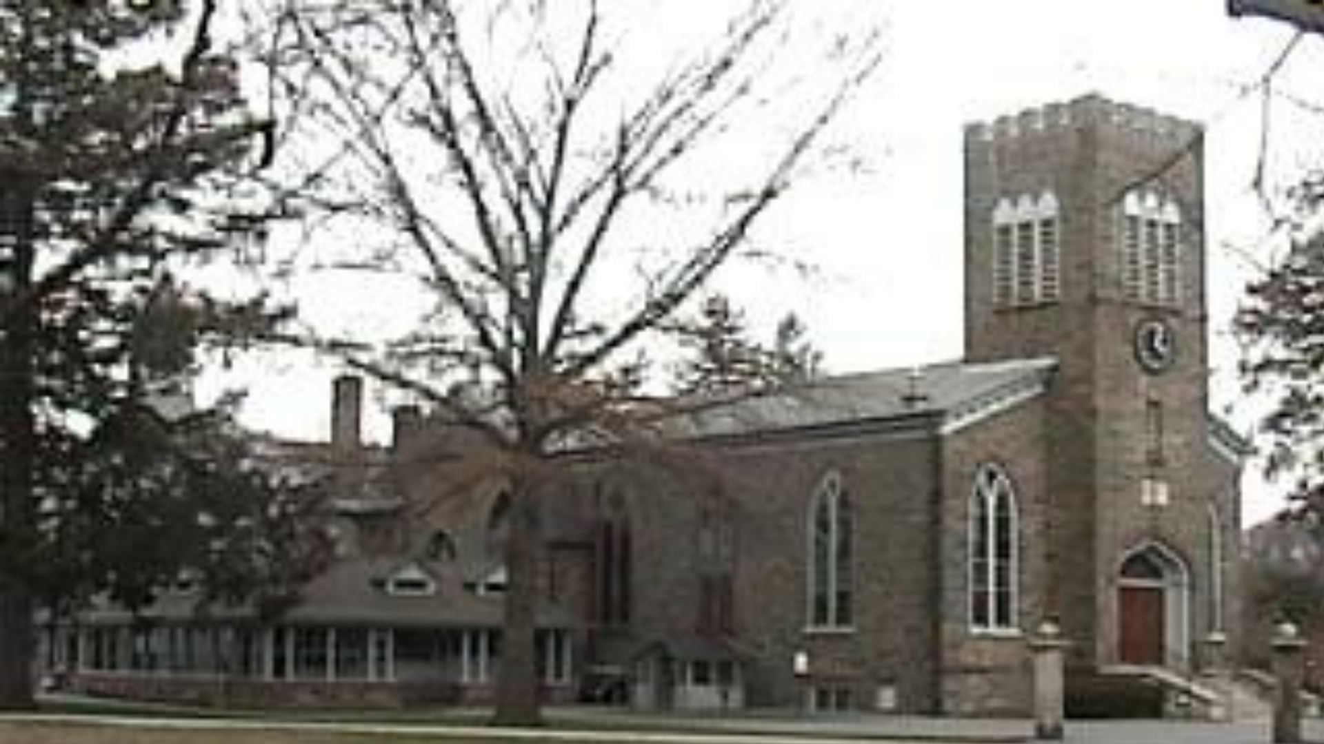
Zion Episcopal Church