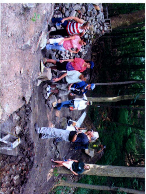
Sixth grade teachers touring the West Point Foundry Preserve during summer 2005.

the historic Village of Cold Spring and the nearby 87-acre West Point Foundry Preserve, a site of historic, cultural and ecological significance owned by Scenic Hudson. Developed specifically for the entire sixth grade, the project will dynamically promote local history and its importance as students work with community leaders, cultural and environmental organizations, artists and educators to learn about where they live.