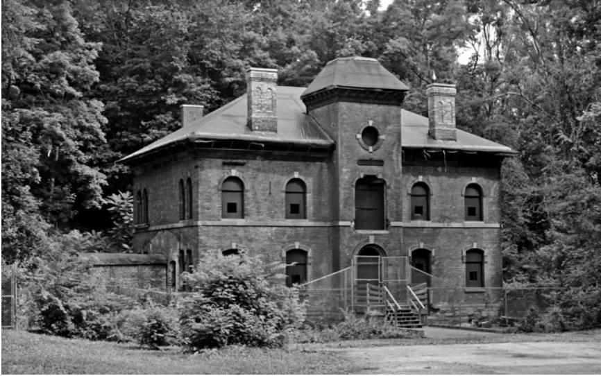
The Office Building in 2005

commonly referred to as the Parrott gun—a cast-iron gun with a rifled bore and a wrought-iron reinforced breech. It spun its close-fitting projectiles as they exited the bore, resulting in greater range and accuracy than comparable smoothbore weapons of the time. The wrought-iron reinforcement of the cannon's breech allowed Parrott guns to withstand the increased pressure generated by the tight-fitting projectiles. This weapon was highly favored by the Union military.