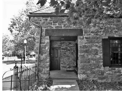
Front entry to the Senate House on the corner of John and Fair Streets

decorated main hall flanked by parlors, one formal and one informal. This main hall served as an opportunity for the owner to display items that would immediately signify the host's importance. In addition to the creation of an entry hall and parlors, the "new" house featured separate bedrooms and a semi-detached kitchen.