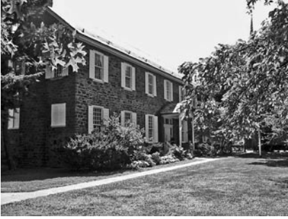
The Colonial Revival Museum building built in the 1920s