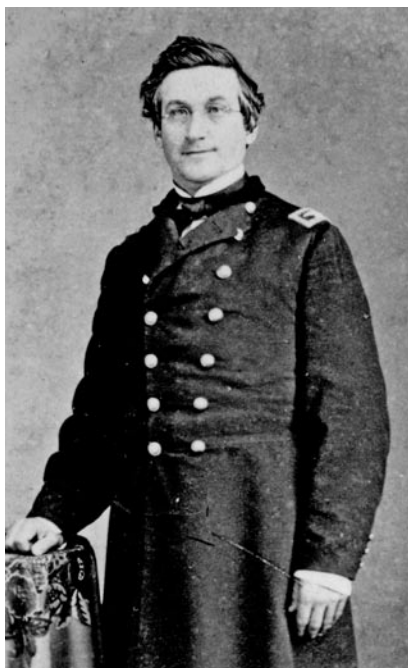
CHARLES H. VAN WYCK Congressman and colonel of the 56th New York, Van Wyck was brevetted a brigadier general at the end of the war to honor his wartime services. He was born in Poughkeepsie in 1824 and died in 1895 after serving as U.S. Senator

The title Legion implies a composite organization that includes more than one branch of service in its organization. At one time in the 1790s, General Anthony Wayne had reorganized the United States Army in the same manner, combing infantry and cavalry within the same unit. The experiment ended with Wayne’s death, but several state militias continued the practice. In New York, it was common for an infantry, or foot regiment, to have a cavalry troop or artillery company as part of its organization. For example, the famed Seventh Regiment had a cavalry troop, a howitzer detachment, and an engineer company. So Van Wyck’s Tenth Legion (named after his own Tenth Congressional District) was within the tradition of the New York State Militia, but its hybrid organization was so alien and unworkable a concept to the federal authorities that its noninfantry companies were detached to serve with different units of the same branch of ser-