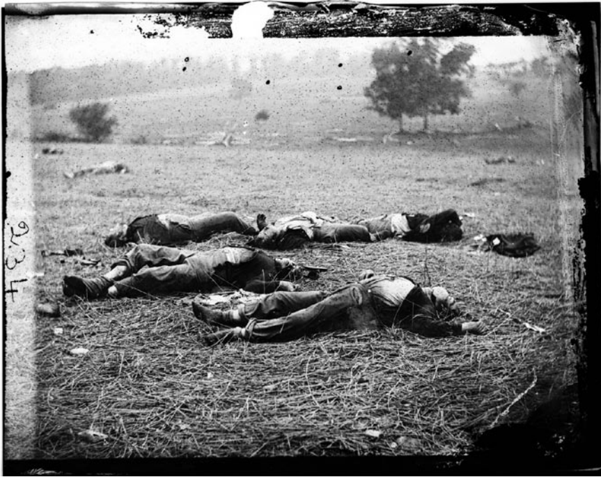
Casualties on McPherson's Ridge, Gettysburg

of the Union cavalry—the two companies made it back to the Union lines on Cemetery Hill. It was 1 p.m. The beleaguered First Corps and the cavalry it had come to support three hours earlier were now outnumbered as much as two to one by the divisions of A.P. Hill's Third Corps to the west and Rodes' recently arrived Division of Ewell's Second Corps to the north. 50