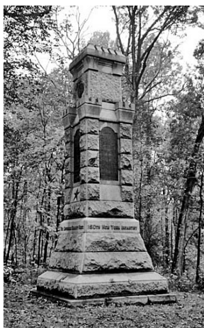
150th New York Monument at Gettysburg