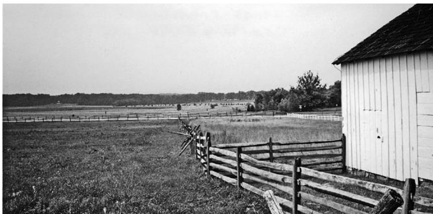
Pickett's Field, Gettysburg National Military Park