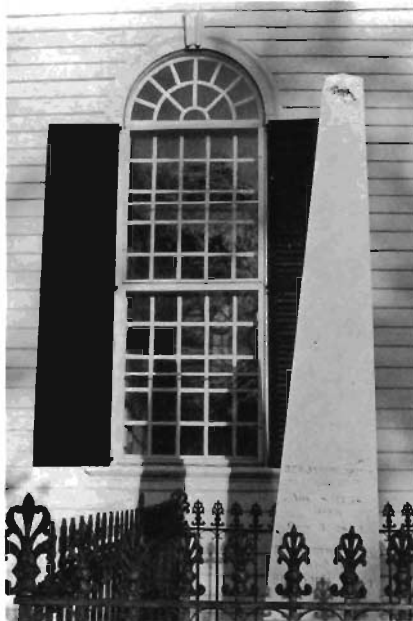
Episcopal Church, Fishkill, NY