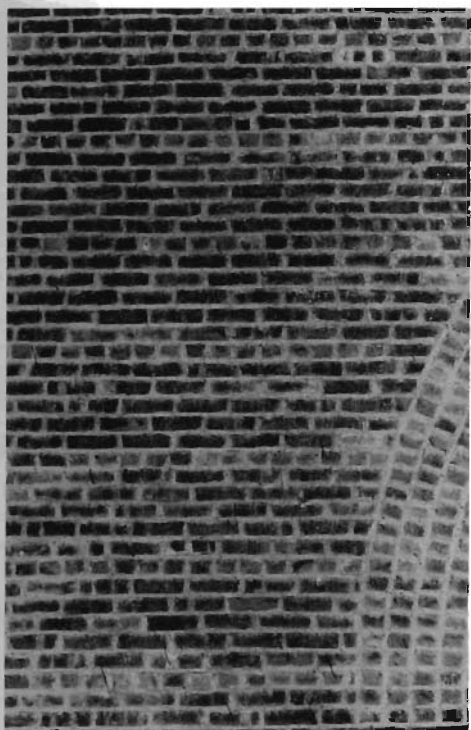
Wall detail 19th c. factory, Newburgh, NY