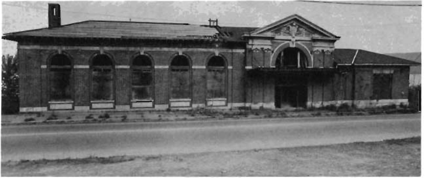
Railroad station, Newburgh, NY