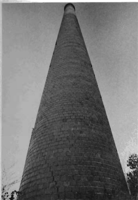
Decayed smokestack, Newburgh, NY