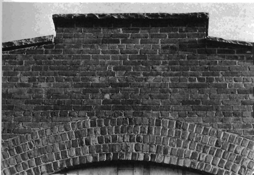
Wall detail 19th c. factory, Newburgh, NY