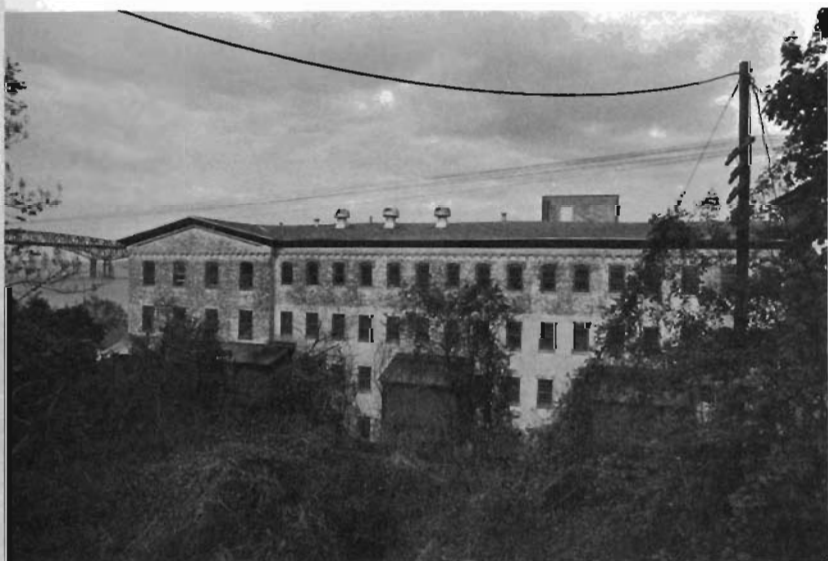
Original Newburgh Steam Mills, now the Regal Bag Corporation, looking northeast from Water Street. The steam mills, built 1844, helped initiate Newburgh's transformation from a mercantile town to a small manufacturing city.