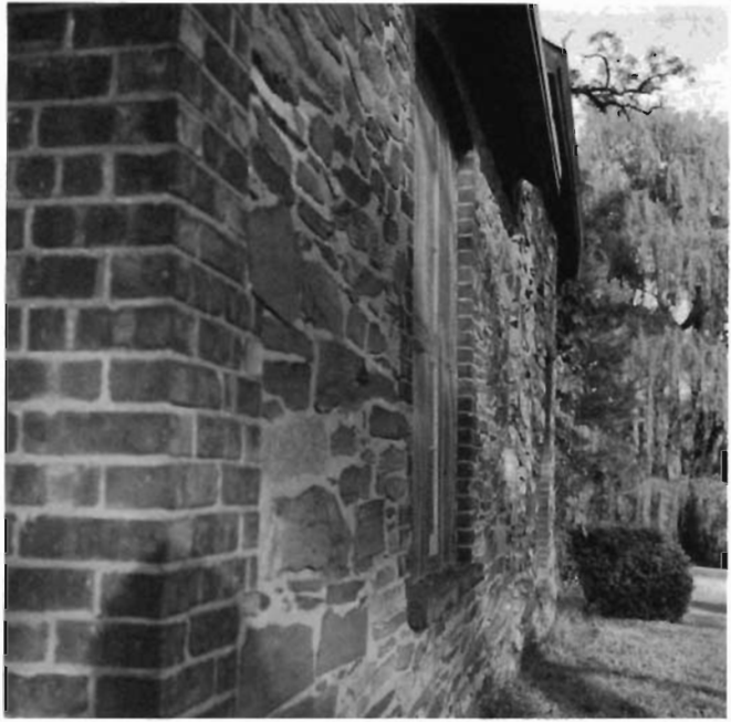
Verplanck farmhouse 18th c. at Stonykill Farm, Wappingers, NY