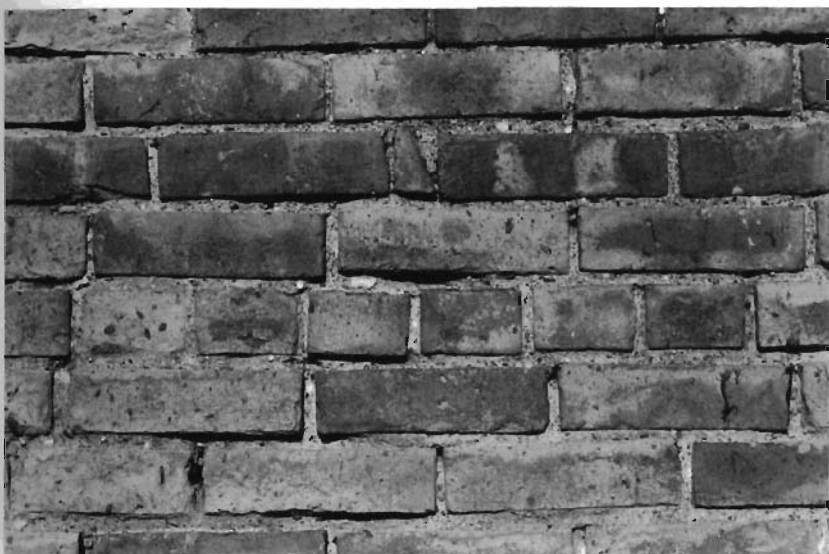
Brick detail 19th c. factory, Newburgh, NY