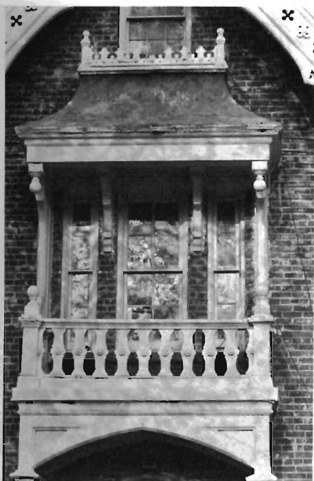
Andrew Jackson Downing house detail. Newburgh, NY