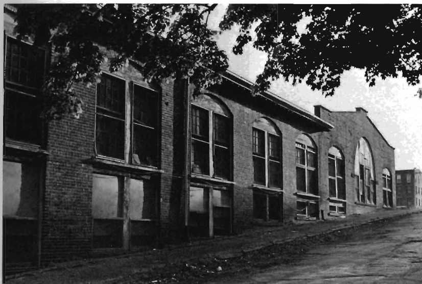
19th c. factory, Newburgh, NY