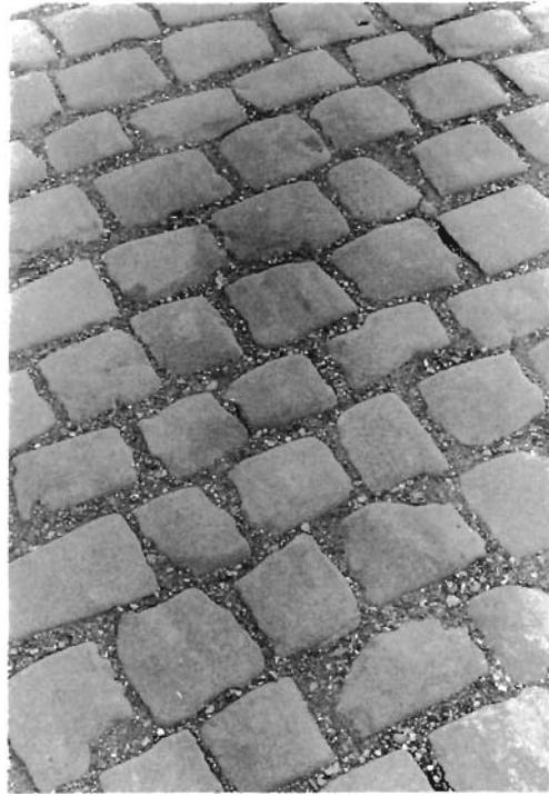
Cobblestone street detail, Newburgh, NY