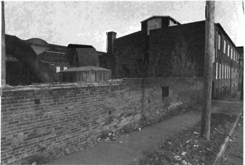
Northern addition, construction ca. 1890, to the Whitehill Engine and Pictet Ice Machine Company, opposite Washington's Headquarters.