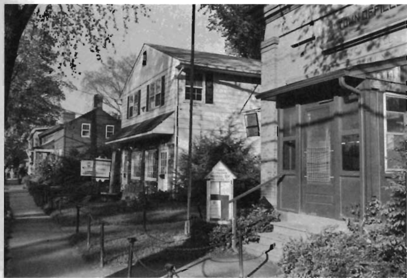
Main Street, Fishkill, NY