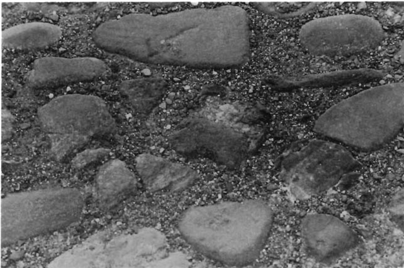
Cobblestones, Newburgh, NY