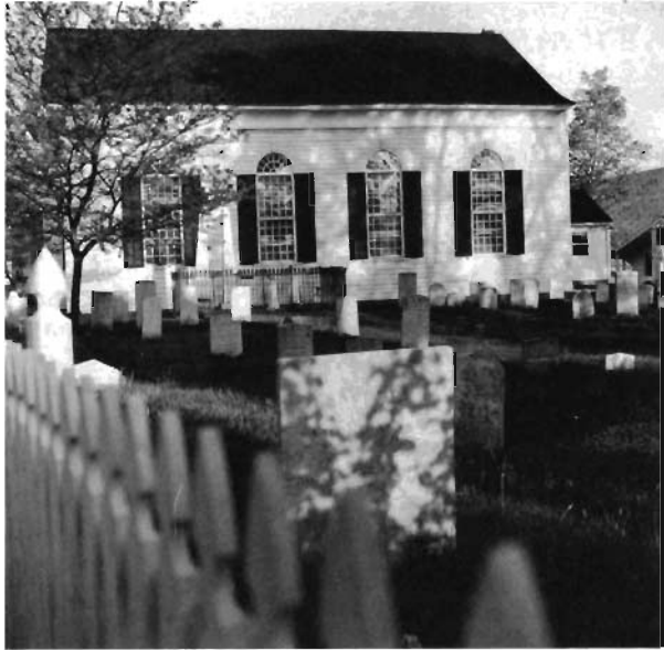
Trinity Episcopal Church, Fishkill, NY, organized by the Rev. Samuel Seabury in 1756. The Provincial Congress met here in September 1776, and the church was used as a hospital during the Revolutionary War.