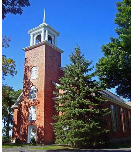
Claverack Dutch Reformed Church

The city of Hudson has a rich culture based off its unique industries in whaling and shipbuilding while also holding various forms of architecture and art. The city today is known for its art forms especially for the painters from the Hudson River School such as Thomas Cole and Frederic Church. This prosperous city is truly a great place to visit as it has a different history from most cities and could potentially be a positive learning experience.