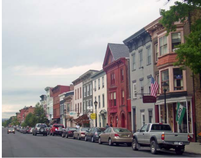
Warren Street, west view, Hudson NY

easy to find information on Hudson and things to do in Hudson, really says something about the city. It is really obvious that Hudson is very welcoming to those who want to visit Hudson and I think that is a great reputation to have.