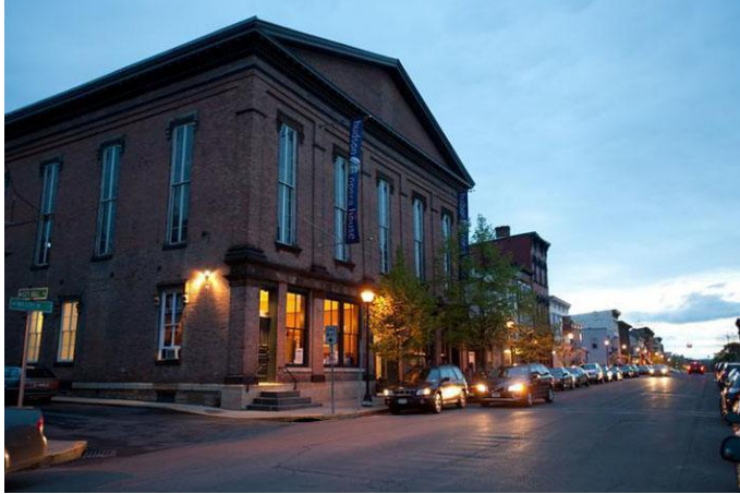
Hudson Opera House

professionally committed artists as well as emerging talent specializing in all types of painting, both large and small sculpture, works on paper and a variety of techniques in photography. Occupying 3000 sq. ft. on Warren Street, the gallery is conveniently located just two hours north of Manhattan. The annual exhibition schedule accommodates 8 exhibits on the main floor as well as a rotating selection of photographs displayed on the second floor.