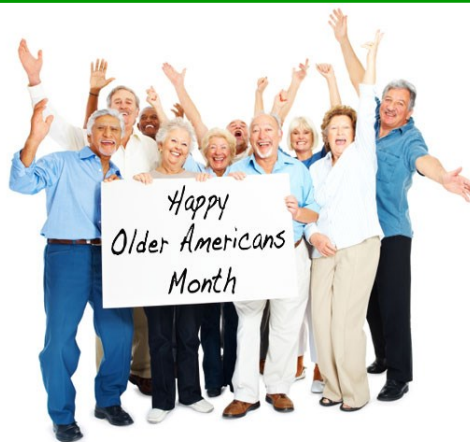
Older American Month

While not one of the most well-known celebrations in the United States, May is Older Americans Month. During this month, senior citizens are shown appreciation through several inexpensive or free events often organized by non-profit organizations. Many of these organizations can be found in the Hudson River Valley. One is the Elant at Goshen Nursing Care Center, located in Orange County. On Tuesday May 15 th at 2 p.m., the center is offering a Bluegrass musical that is being