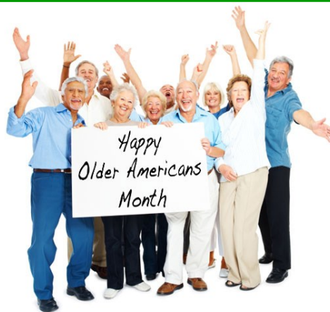
Older American Month

While not one of the most well-known celebrations in the United States, May is Older Americans Month. During this month, senior citizens are shown appreciation through several inexpensive or free events often organized by non-profit organizations. Many of these organizations can be found in the Hudson River Valley. One is the Elant at Goshen Nursing Care Center, located in Orange County. On Tuesday May 15 th at 2 p.m., the center is offering a Bluegrass musical that is being