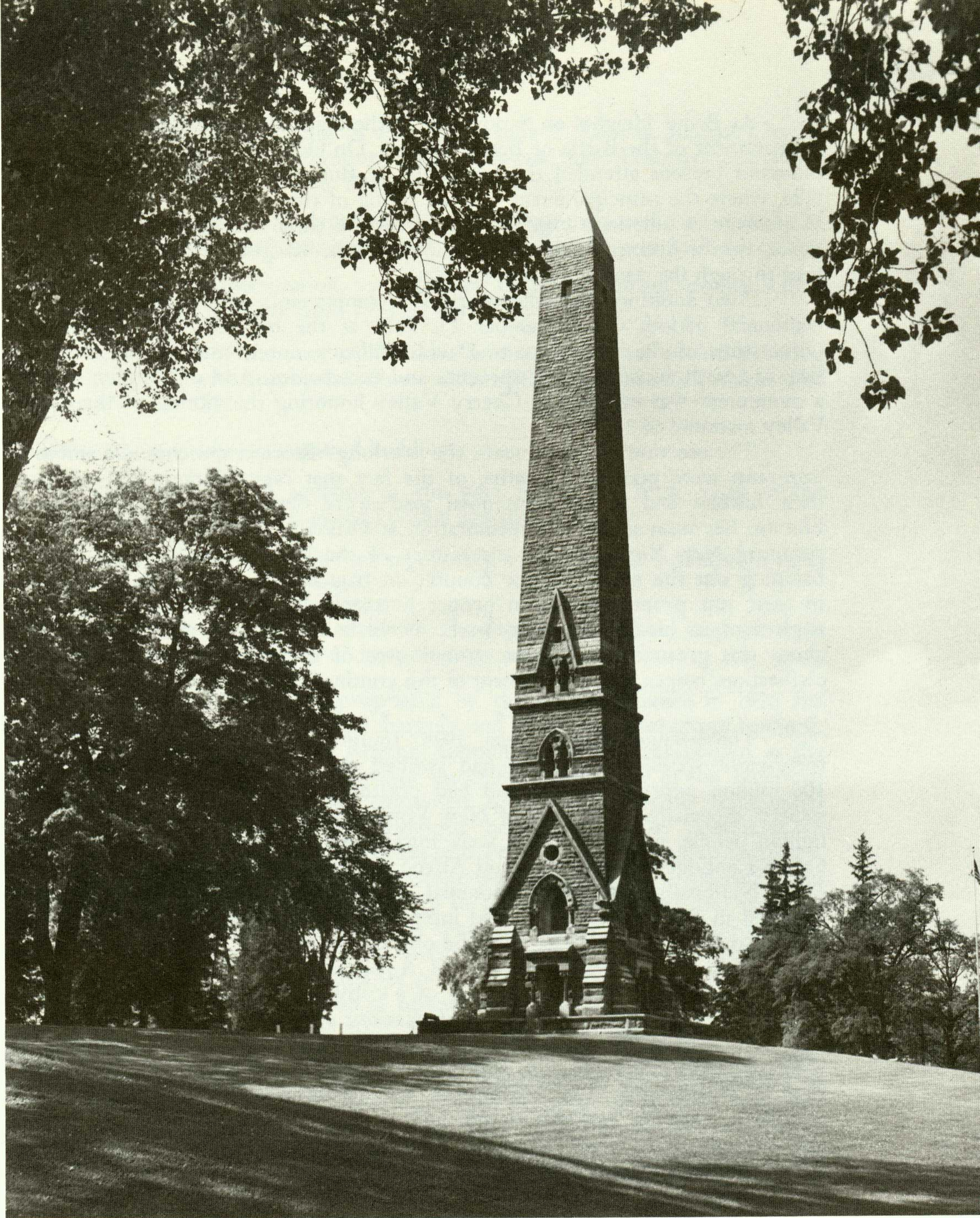
The Saratoga Battle Monument at Schuylerville was erected as part of the Centennial observances in 1877. A winding stairway inside the 154-foot granite tower leads the visitor to a view overlooking the site of Burgoyne's surrender of October 17, 1777.