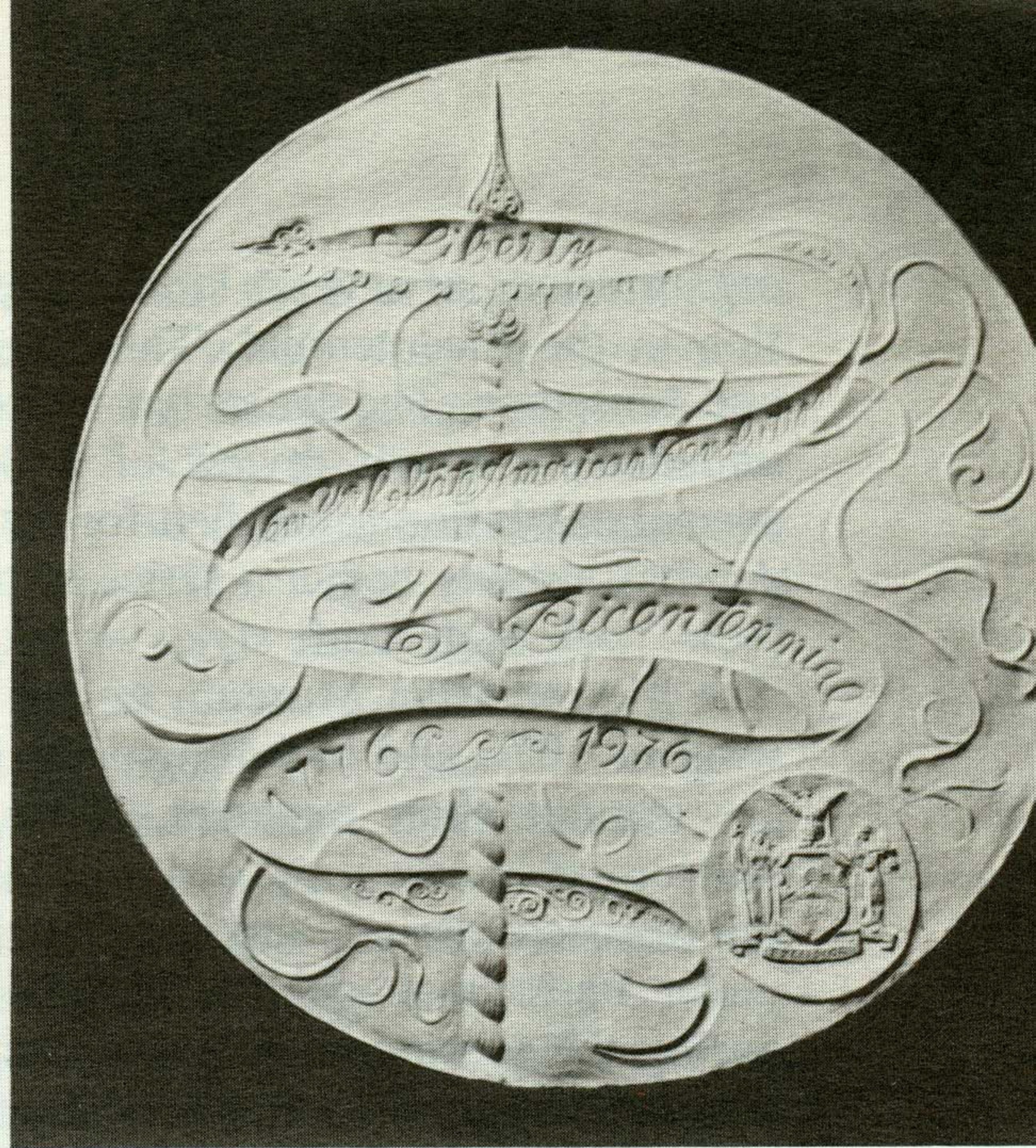
The official New York State American Revolution Bicentennial Medal features the bust of a colonial patriot. The seal of the American Numismatic Society is in the lower left and the signature "Americo" in the lower center. The reverse shows a stylized Liberty Pole with an inscribed pennant, and below it the Seal of the State of New York.