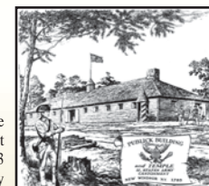
Public Building and Temple U. States Army Cantonment New Windsor N.Y. 1783

ADMISSION TO NEW WINDSOR CANTONMENT IS $4 ADULTS, $3 SENIOR CITIZENS, $1 CHILDREN