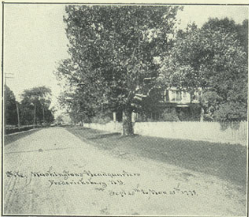
Site, Washington Headquarters Fredericksburg Va. Sept 26 to Dec 21, 1777.