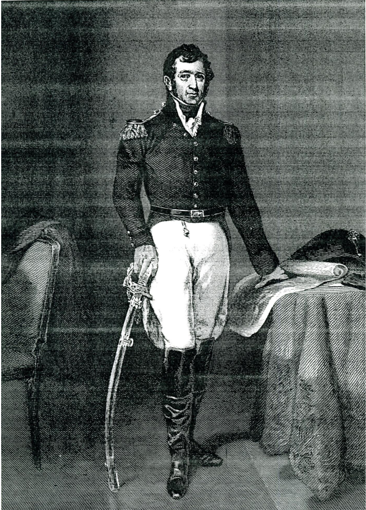
Maj. Gen. Jacob Brown as depicted in an engraving published in 1862